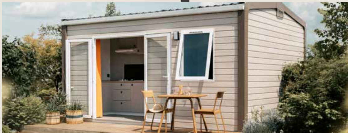
The duo model