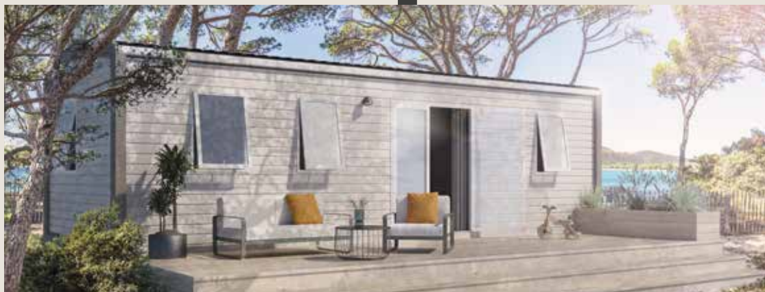
The family model