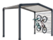
Extra storage: bikes, surfboards, garden equipment, etc