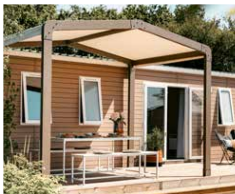
Relaxation space modul'home

An entrance hall, relaxation area or storage space, modul'homes are perfectly suited to mobile homes with 1- and 2-slope roofs. They can be placed at the gable end or separately from the mobile home.