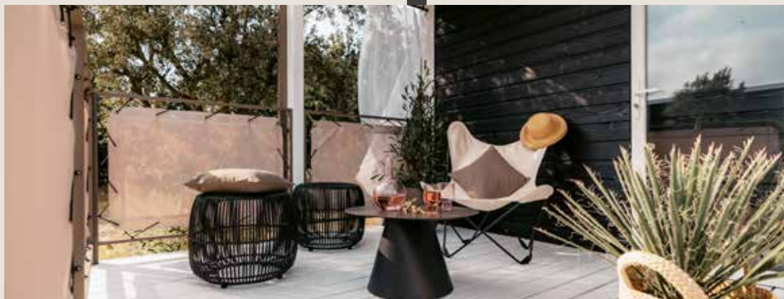
The compact model with a terrace

Model shown with the metal and fabric guard rail option