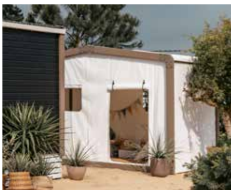
Extra room Modul'home

An entrance hall, relaxation area or storage space, modul'homes are perfectly suited to mobile homes with 1- and 2-slope roofs. They can be placed at the gable end or separately from the mobile home.