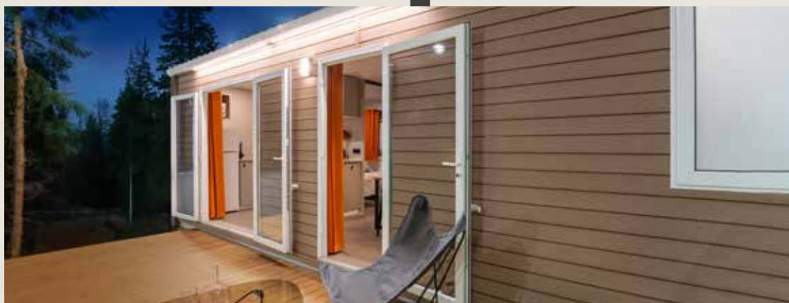
The essential model