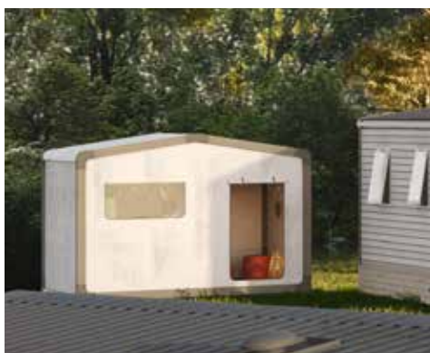
Extra room Modul'home

An entrance hall, relaxation area or storage space, modul'homes are perfectly suited to mobile homes with 1- and 2-slope roofs. They can be placed at the gable end or separately from the mobile home.