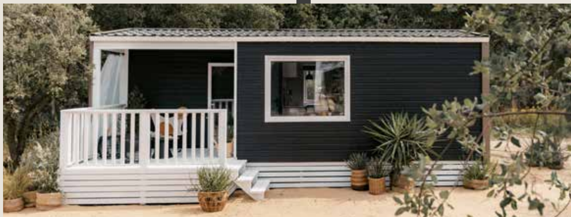
The model with a view