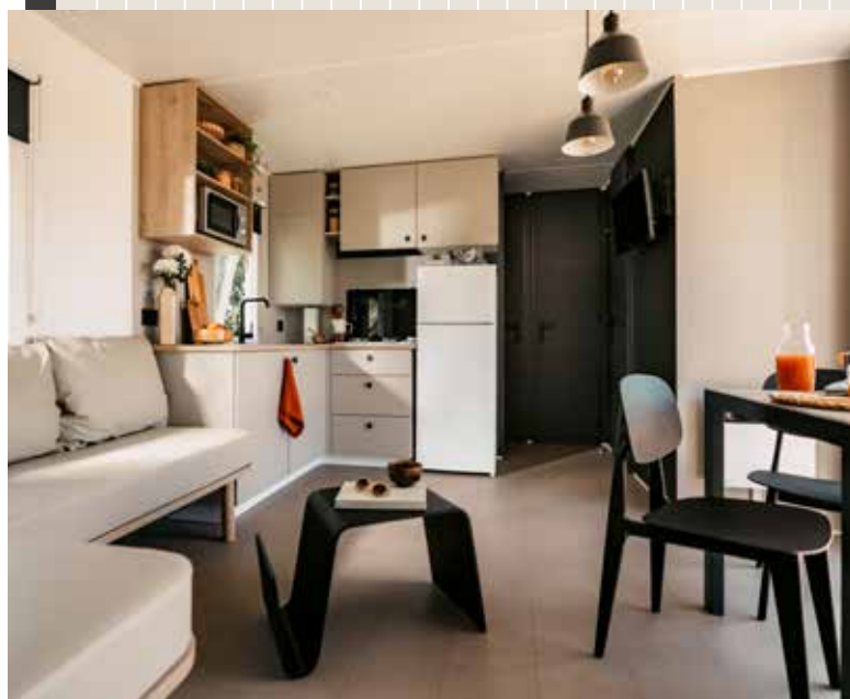
Model shown with silver fridge/freezer option