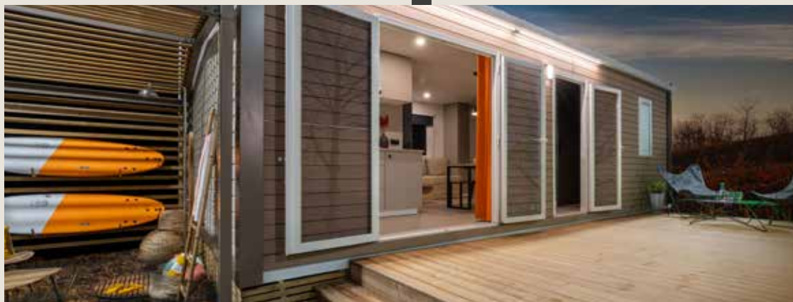
The inside-outside model