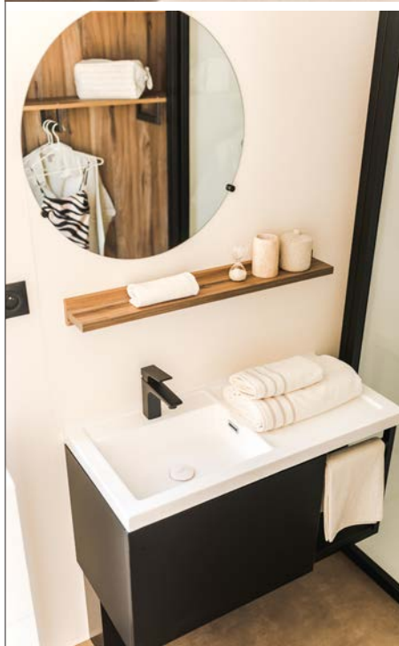
Shelf with round mirror above Suspended dual flush WC

Design the Key West to suit your camp site with the help of your sales advisor's configurator program, view your plot directly.