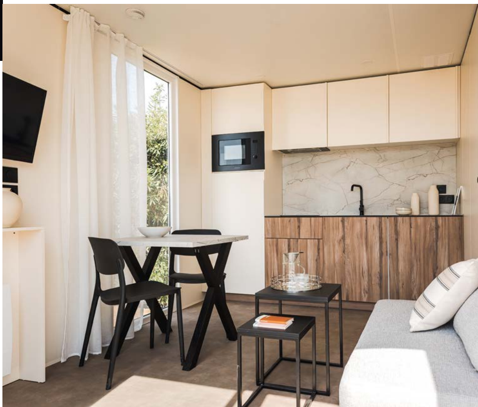
Kitchen with optional 2-rings induction hob and integrated microwave

90 cm wide vanity unit with built-in storage and towel rails