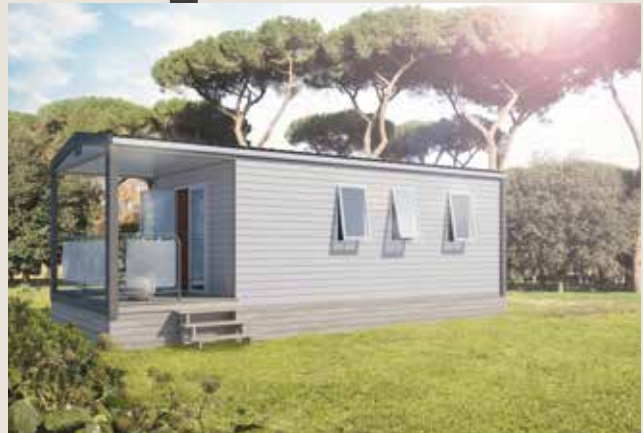
Model shown with the metal and fabric guard rail option