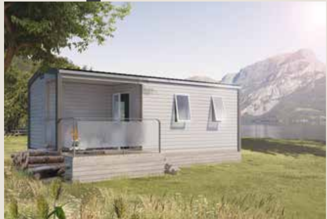
Model shown with the metal and fabric guard rail option