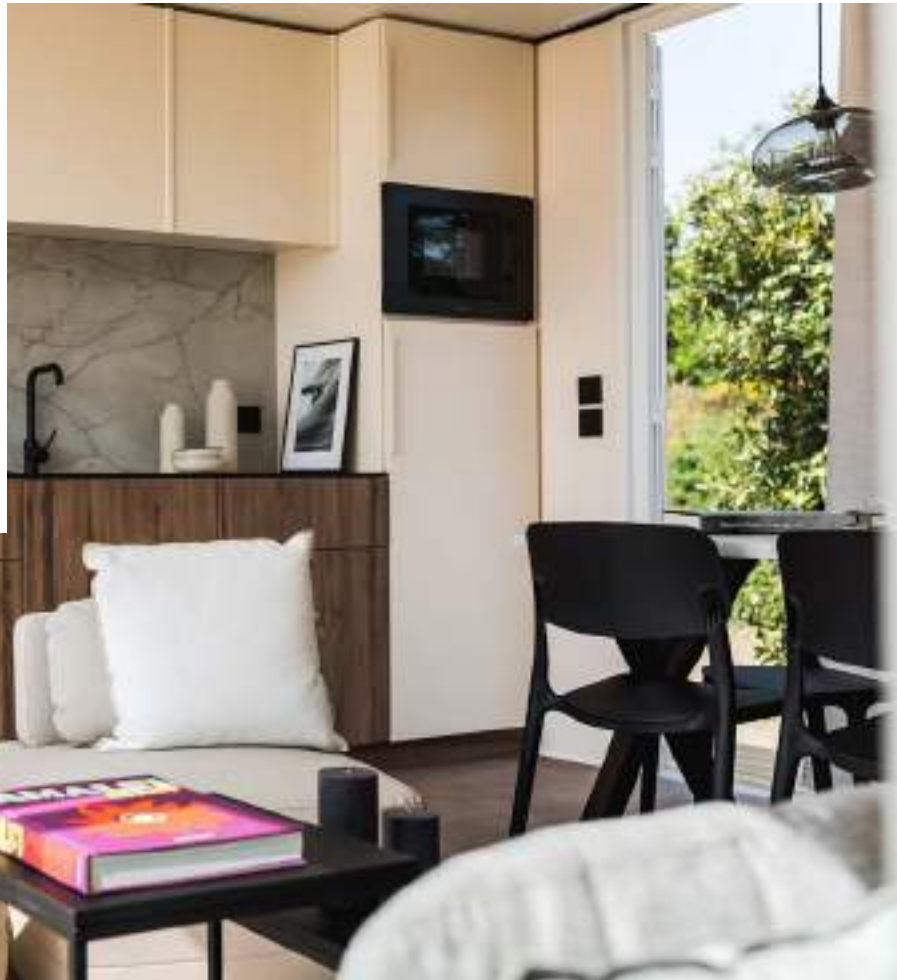
Kitchen with integrated microwave options

A haven of peace for large families who love spending time together but also like having their own space. The master suite and the children's/guest's bedrooms are cleverly arranged to ensure privacy. From the master suite, the direct access to the terrace through the 2-winged bay allows you to leave without having to cross the living area.