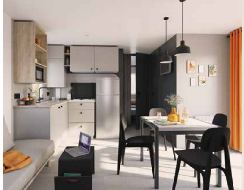
Model shown with silver fridge/freezer option

An entrance hall, relaxation area or storage space, modul'homes are perfectly suited to mobile homes with 1- and 2-slope roofs. They can be placed at the gable end, as an entrance, or separately from the mobile home.