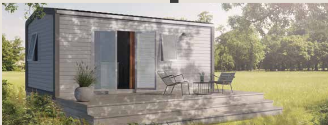
The optimised model