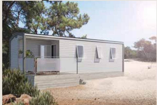
Model shown with the metal and fabric guard rail option