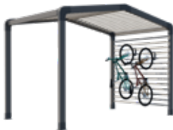
Bike rack and/or storage