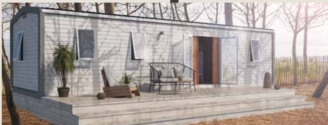
The high-status model