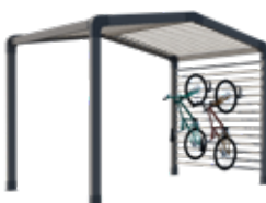
Bike rack and/or storage