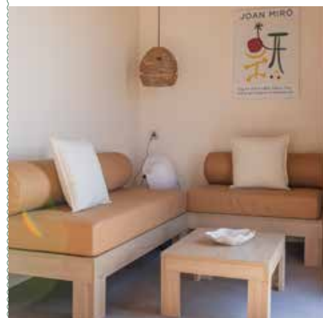
Optional coffee table